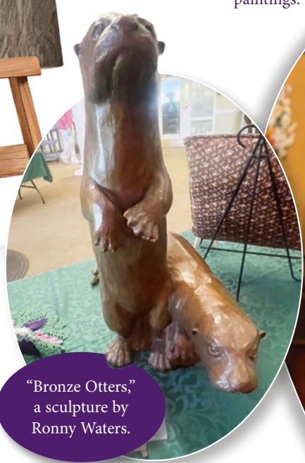
"Bronze Otters," a sculpture by Ronny Waters.